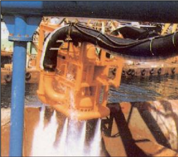
DPA200 Pump Dredging