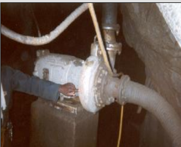
VH20 Pump Mining industry

TOYO pumps have been in operation for more than 50 years in many applications, notably :