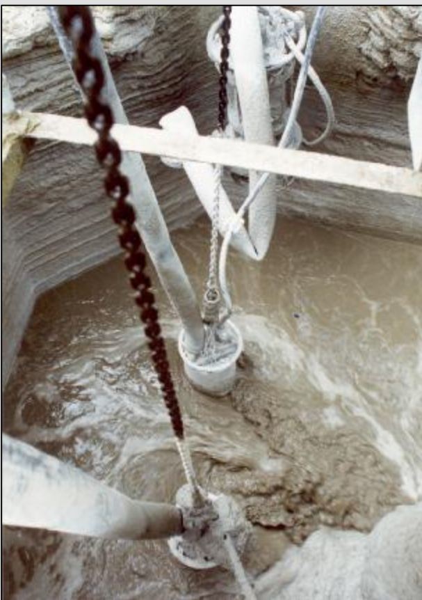
ET10 and DP10 Pumps Concrete factory