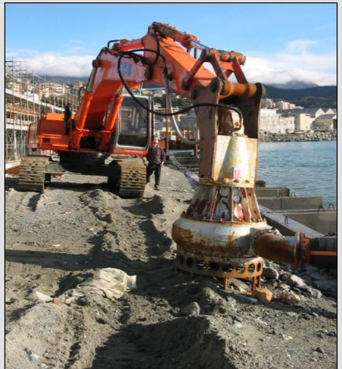
DPH300 Pump Civil works